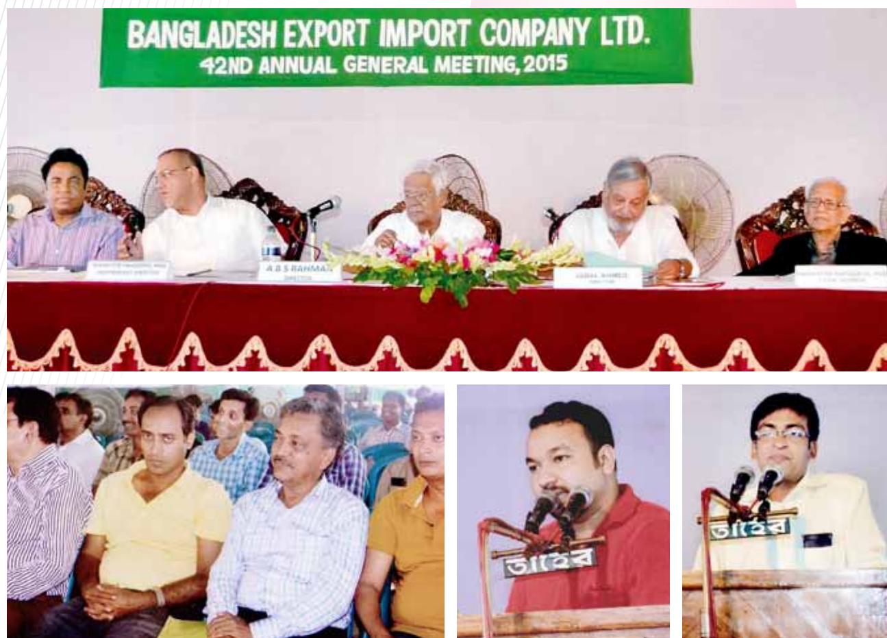
PICTORIAL VIEW OF 42 ND ANNUAL GENERAL MEETING